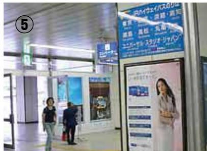
⑤ Down to the 1F, exit is on your left.