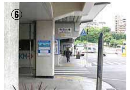
⑥ Out of the Sta., refer to the map. Turn left to the bus stop bound for "Tokushima (徳島)/Awaji-shima (淡路島) Area" and take the bus bound for "Higashiura BT". Get off at "Awaji Yumebutai-mae".